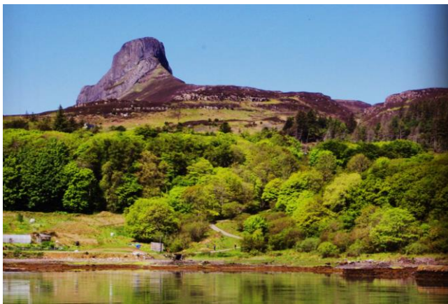
Pitchstone inselberg of An Sgùrr on Eigg (Phil Patterson)