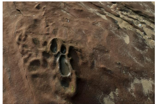
Triassic Sandstone at Hilbre Island with a Chirotherium footprint (fake news alert!) (Catherine Kenny)