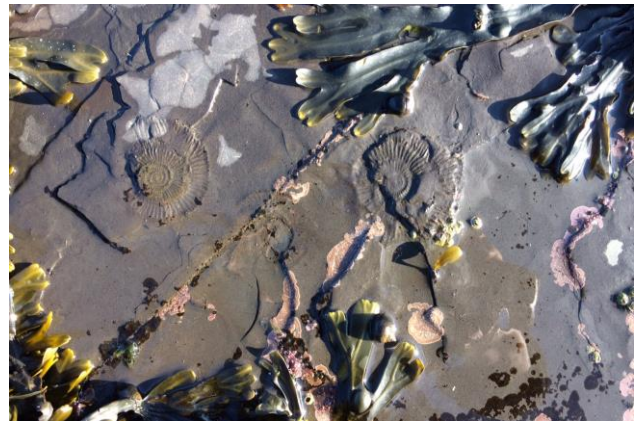
Ammonites in the Jurassic Bituminous Shale in Saltwick Bay, Whitby