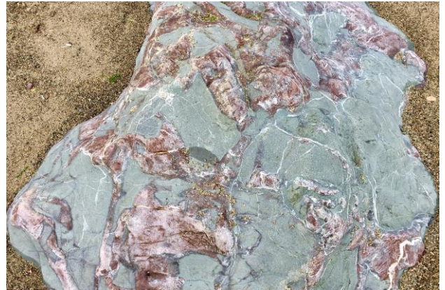
Green dolerite(?) at Aberdaron (Phil Patterson)