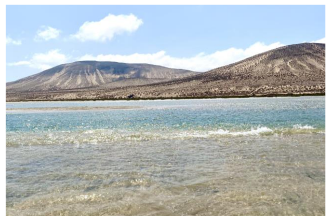
Last volcanic activity in Fuerteventura occurred between 4,000 and 5,000 years ago (Foz Jammal)